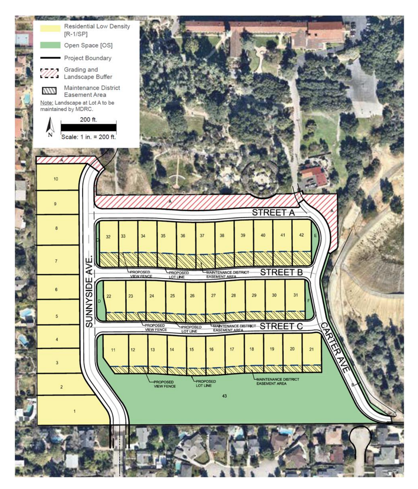
EXHIBIT A: PLAN LAYOUT